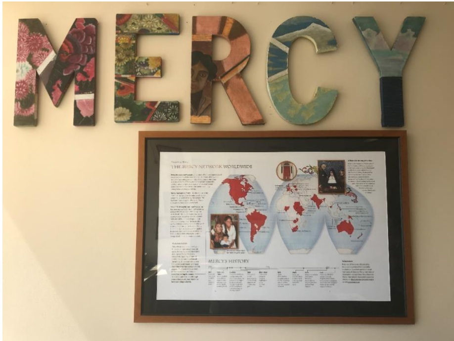
Poster in the Mercy Global Action office, New York

A further initiative in 2019 has been the Mercy Global Action Emerging Leaders' Fellowship. Ten women have been awarded a Fellowship which enables them to pursue a line of enquiry within one of the two themes which culminates with a report presented at Mercy International. The first year of Fellowship recipients did not include a Kiwi which I saw as an opportunity for a young New Zealand woman in the future.