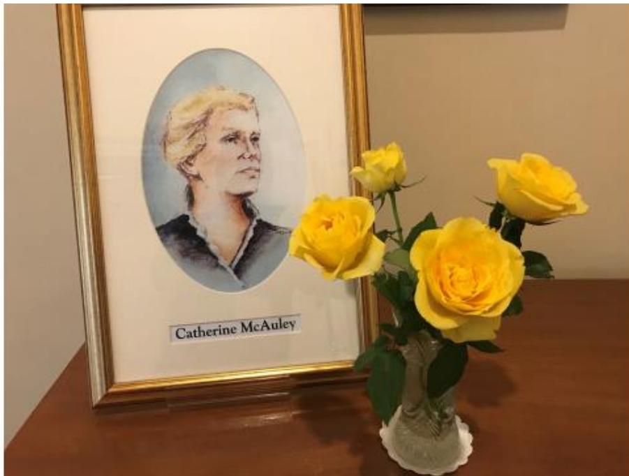
Catherine McAuley 1778 – 1841 Foundress of the Sisters of Mercy

In May 2018 I proposed in my MOE Principal's Sabbatical application that, 'I wish to travel to Dublin, Ireland and engage in a programme at the Mercy International Centre. I also wish to visit and work in a secondary school in Samoa; offering my services to support and understand leadership, administration, and teaching and learning.'