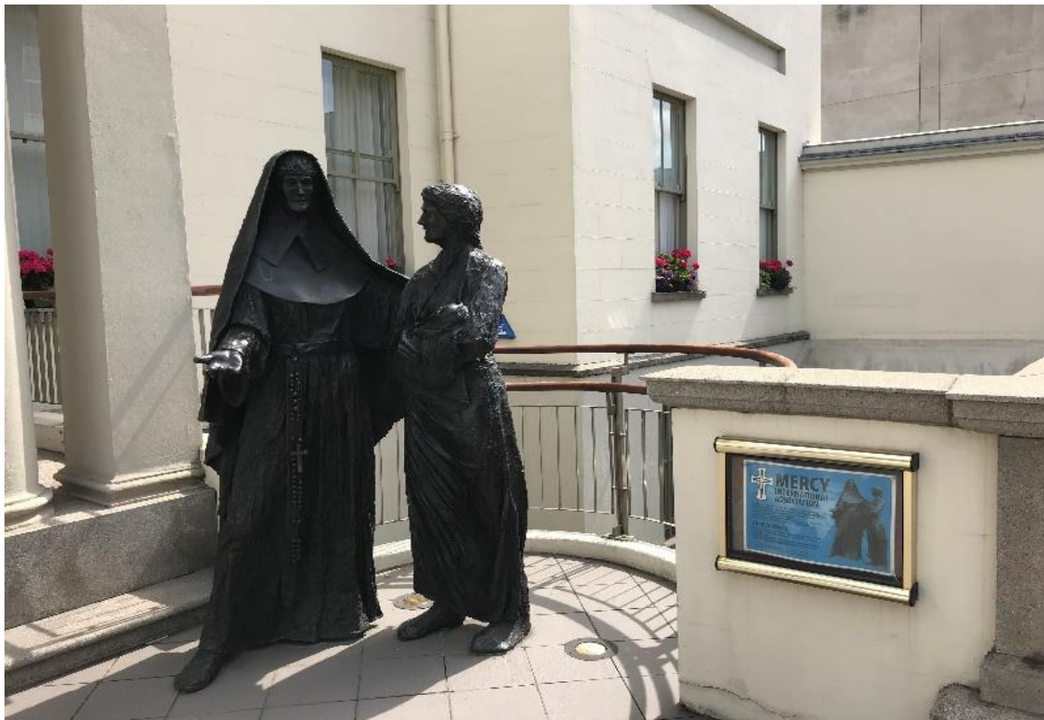
Statue of Catherine McAuley, Mercy International, Dublin